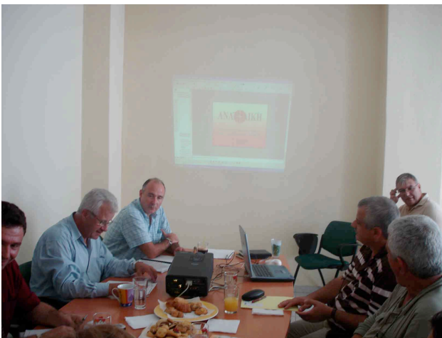
Advisory Group meeting Anatoliki

Greece, Central Macedonia: geothermal applications in tourism and agriculture;