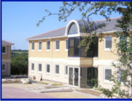
Threemilestone Industrial Estate ~ high specification offices – Cornwall, UK

The case studies are fully developed, starting with the analysis of the regional economic and energy context, the energy policy objectives, the local development objectives, the available legislation and incentives, the target groups (public or private organisations), the economic and financial opportunities, the need for public support, the type of proposed aid scheme, the strategic environmental assessment and the procedures for implementing the aid scheme. The case study development is monitored by an Advisory Committee in each region, where all the relevant actors and authorities are involved. SOFENA participates as coordinator of dissemination activities, leading the partner efforts towards new Member States and Accession Countries.